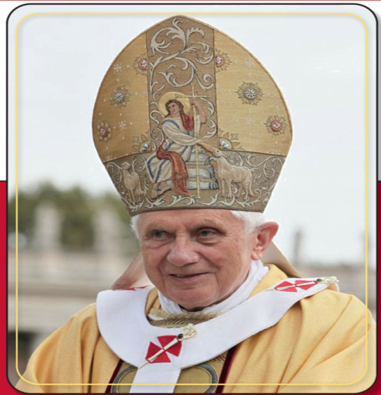
POPE EMERITUS BENEDICT XVI APRIL 16, 1927 – DECEMBER 31, 2022