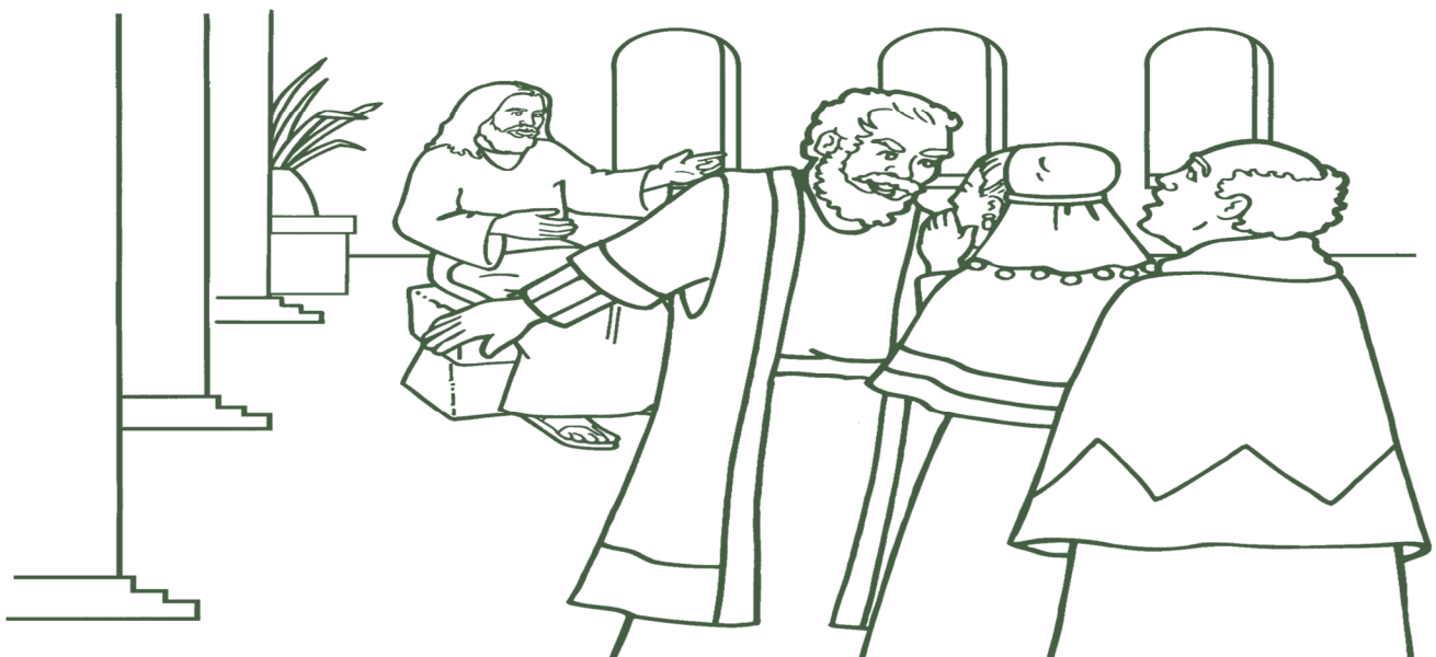
What kind of wisdom has been given Him? Mark 6 : 2