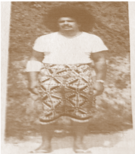
The Wild Man of Borneo on tour of Fiji Islands, 1958.